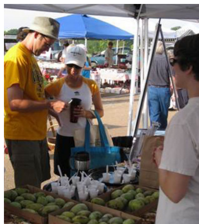
Right: Paw-paw samples and sales at the Farmers Market. Below: Chestnuts sold in a local natural products store

Pricing to the Market. When you're just starting out, pricing to the market is often the simplest approach. Pricing to the market involves finding out what others are charging for the same products, and then using that information to establish a similar price range. Buyers are also pricing to the market when they tell you what they're willing to pay for your products. Pricing information on agricultural products can be obtained from a number of sources. If you plan to sell directly to the public, various