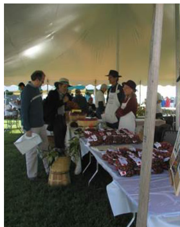
Top: Curly willow can be a profitable crop when sold to local florists (Nebraska Woody Florals Cooperative). Left: Chestnuts sold at the Missouri Chestnut Roast Festival